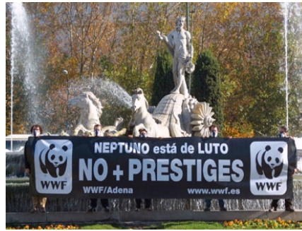
Fig.1: WWF-Spain demonstration in Madrid at the Neptun fountain of Plaza de las Cibeles. "Neptun is in mourning. No more Prestiges"