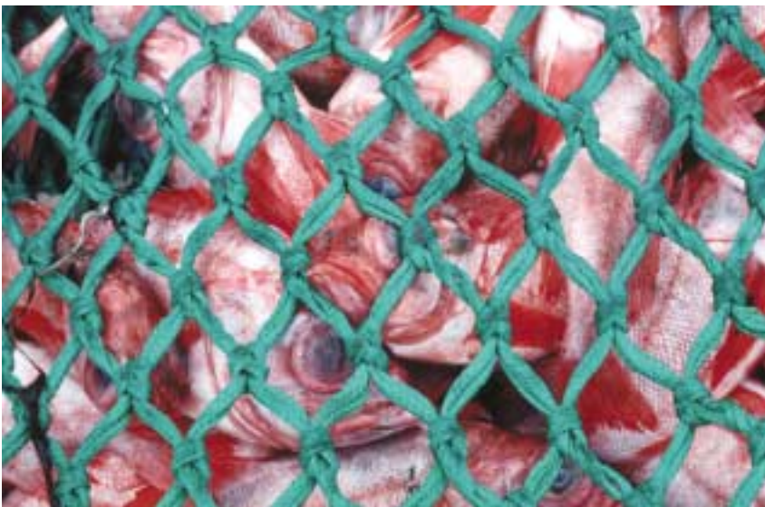
The rapidly expanding deep sea fishing industry targets fish stocks that rapidly can be depleted, such as this deep sea redfish ( Sebastes mentella ).

...until now there is no high sea MPA on the planet